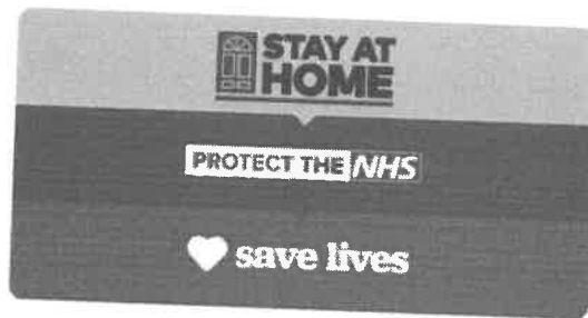
5:59 PM · Mar 21, 2020 · TweetDeck